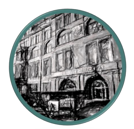
The Lister Hospital

Chelsea Bridge Road London SW1W 8RH 0207 881 4029